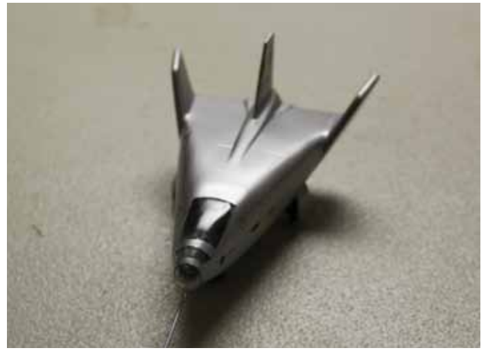
Northrop HL-10 Lifting Body, 1/72, by Howard Rifkin