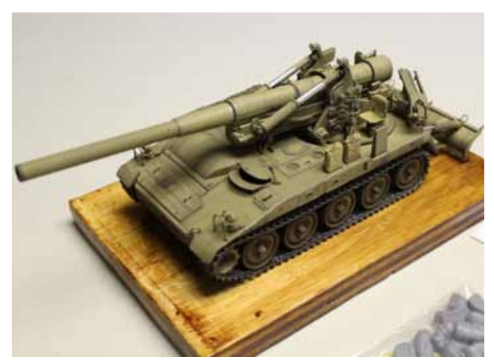
M-107, 1/35, by Joe leonetti