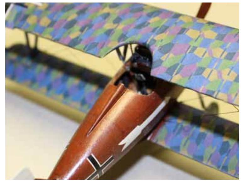
Mark's build features a wood-grain painted fuselage. At right some in process shots of the wood graining using oil paints for the effect. This is before the application of transparent color to simulate the dark stain and varnish.

his is a model I wanted to do for some time. This is a model of firsts for me. The SSW D. III has a good amount of rigging and I wanted to see if I could put in all those wires. Previously, the Fokker Dr. I is the only World War I aircraft I'd completed and it has very little rigging. Thank goodness for the stretchy rigging line from Aeroclub and a magnifying visor. I also wanted to see if I could pull off painting convincing wood grain effects on the propeller and fuselage interior and exterior.